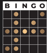
Game 5 Page 3 TRIPLE BINGO W/ WILD