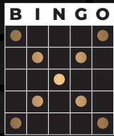
Game 1 Page 1 LETTER X