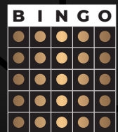
Game 11 Page 6 COVERALL

ONLY 1 ELECTRONIC MACHINE PER PERSON. ALL PAPER MUST BE MARKED WITH A DAUBER. See Bingo Hall For Rules.