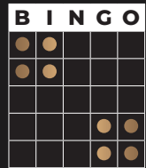
Game 8 Page 4 2 POSTAGE STAMPS