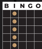
Game 9 Page 5 REGULAR BINGO (INTO)