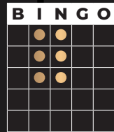
Game 7 Page 4 BLOCK OF 6 FREE SPACE GOOD