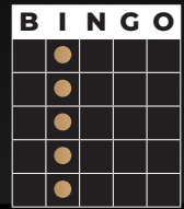
Game 2 Page 2 REGULAR BINGO (INTO)